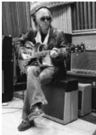
TOM PETTY, LEFT; MARK KNOPFLER, TOP RIGHT; NEIL YOUNG, BOTTOM RIGHT