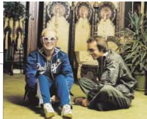
ELTON JOHN AND BERNIE TAUPIN